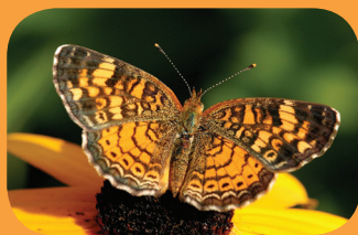
Pearl Crescent Phyciodes tharos