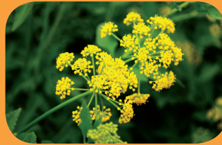
Golden Alexander Zizia aurea or zizia aptera