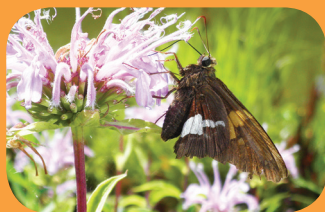
Silver-Spotted Skipper Epargyreus clarus