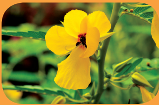
Partridge Pea Chamaecrista fasciculata