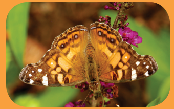
Painted Lady Vanessa cardui