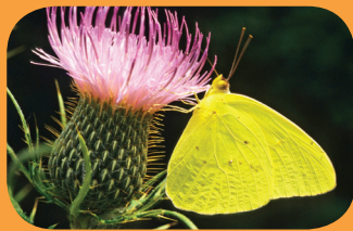
Cloudless Sulfur Phoebis sennae