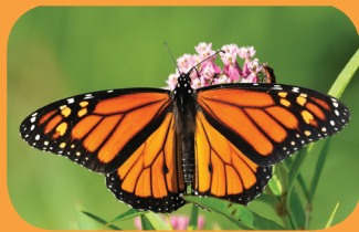
Monarch Danaus plexippus