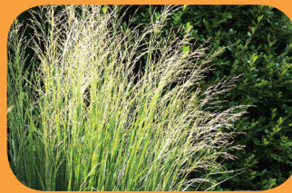
Switch Grass Panicum virgatum