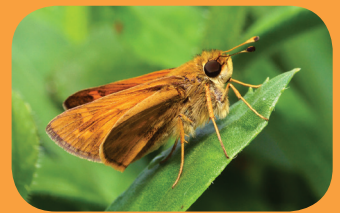
Grass Skipper Hesperiidae