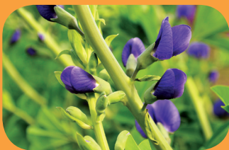
False Blue Indigo Baptisia australis