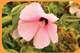
Rose Mallow Hibiscus lasiocarpus