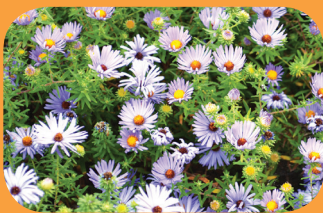
New England Aster Symphotrichum novae-angliae