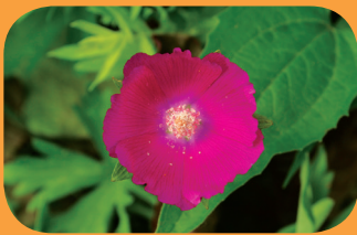
Purple Poppy Mallow Callirhoe involucrata