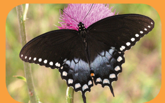
Spicebush Swallowtail Papilio troilus