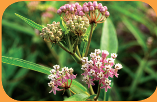
Swamp Milkweed Asclepias incarnata