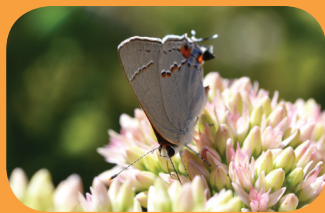
Gray Hairstreak Strymon melinus