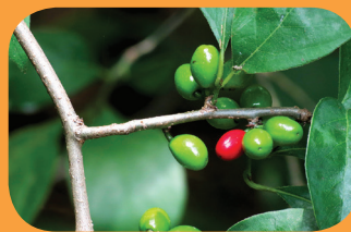
Spicebush Lindera benzoin